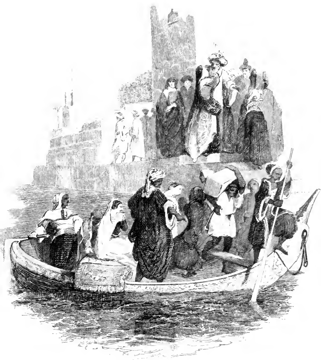
THE GREAT NAUROY